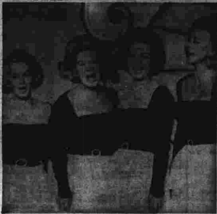
The King Sisters—Yvonne, Alyce, Louise and Marilyn (left to right)—headline an hour-long musical special featuring 29 members of their family on ABC-TV's "The Family Is King" tonight from 9:30-10:30 p.m.